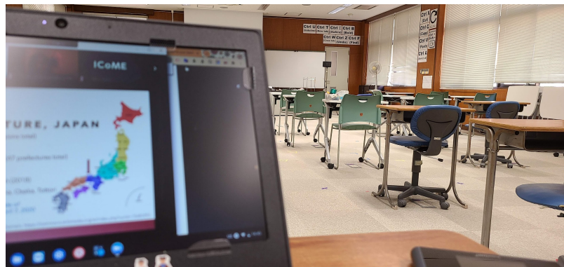
My very humble LL

My setting influenced my design. First, I wanted something designed for an active listening class. I teach a class that is twice a week; one session is called "speaking" and the other is called "listening". The once-a-week speaking class is dedicated to performance tasks, such as poster sessions, conversation tests, and presentations. Thus, the LL was going to be for the listening class, once a week, for 50 minutes.